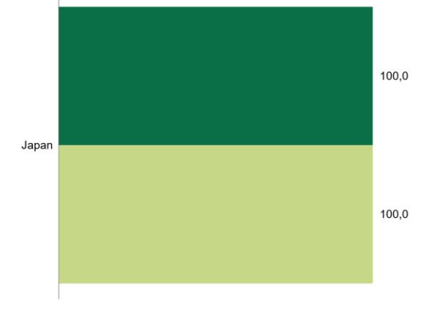
Breakdown by currency (as % of assets, excluding liquidity)